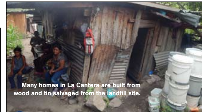
Many homes in La Cantera are built from wood and tin salvaged from the landfill site.