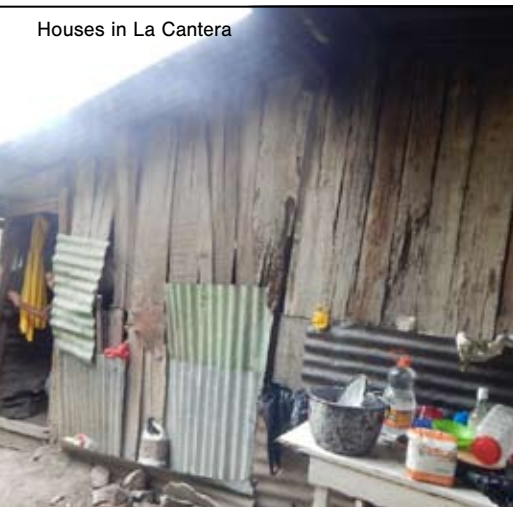
Houses in La Cantera