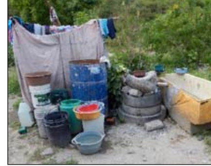
Without a pila, water is stored in whatever containers can be found

While daily life here will continue to be difficult, your support will bring much-needed help to 30 of the neediest families in La Cantera.