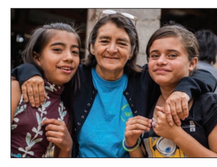
At-risk youth are encouraged by mentors through Impact Clubs.

those with young children and where the homes have serious safety and sanitary deficiencies.