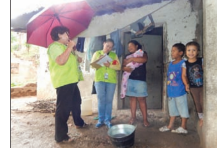
Meeting with one of the families that is in need of a pila (water tank)

One Day Challenge projects will benefit families in extreme poverty, particularly those with young children and where the